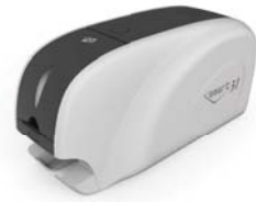
Rewritable ID CARD PRINTER smart-31 R