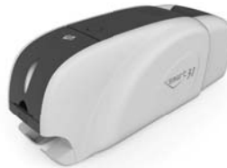
Dual sided ID CARD PRINTER smart-31 D