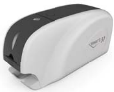
Single sided ID CARD PRINTER smart-31 S